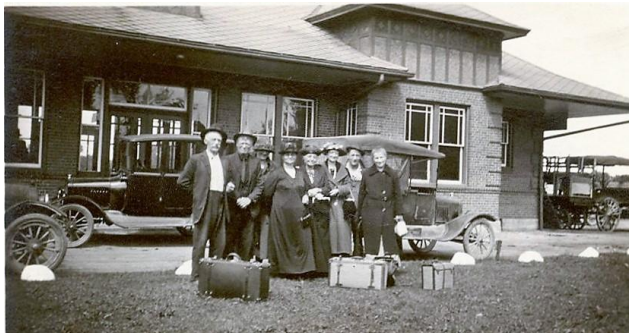
Chicago & Northwestern Depot-West De Pere