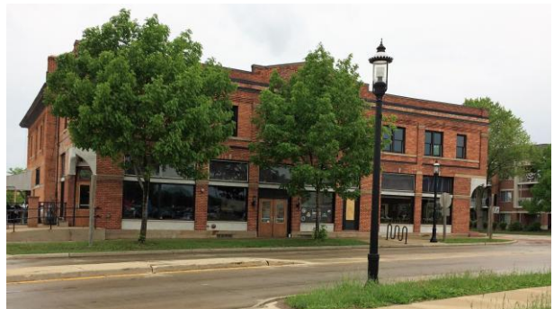
Brickhouse Burgers & Julie's Cafe